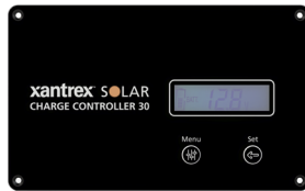
PWM Charge Controller 30A 709-3024-01