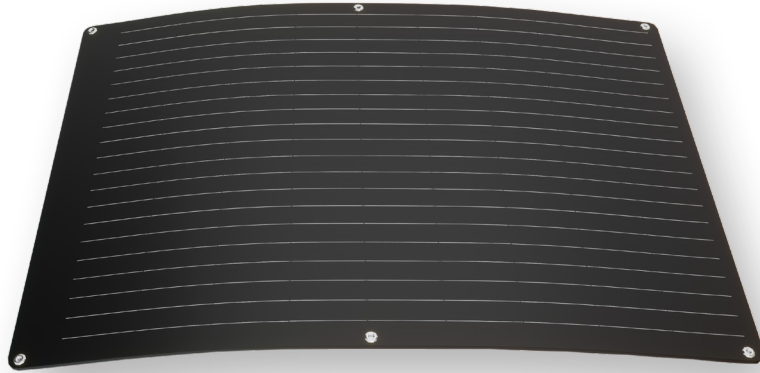
110W Xantrex Solar Flex Panel