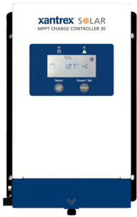
MPPT Charge Controller 30A 710-3024-01