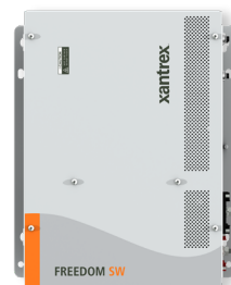
FREEDOM SW INVERTER/CHARGER