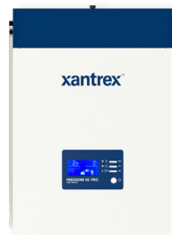
FREEDOM XC PRO INVERTER/CHARGER