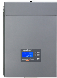
FREEDOM XC INVERTER/CHARGER