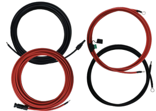
Solar & Battery Cable Starter Kit 708-0150