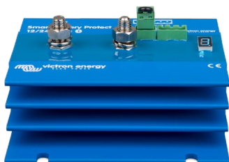
Smart BatteryProtect BP-220