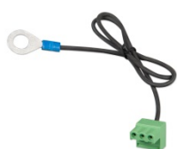
Connector with preassembled DC minus cable (included)