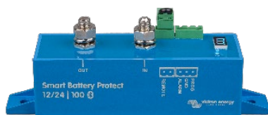
Smart BatteryProtect BP-100