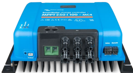
SmartSolar Charge Controller MPPT 250/100-MC4 without display