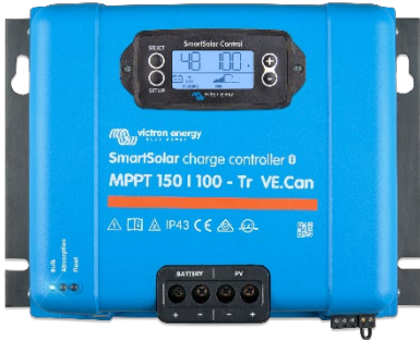
SmartSolar Charge Controller MPPT 150/100-Tr VE.Can with optional pluggable display