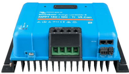
SmartSolar Charge Controller MPPT 150/100-Tr VE.Can without display