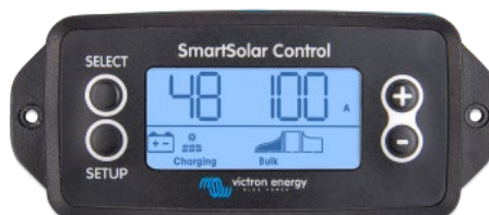
SmartSolar pluggable display

Simply remove the rubber seal that protects the plug on the front of the controller, and plug-in the display.