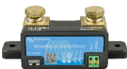
Bluetooth sensing: SmartShunt