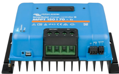
SmartSolar Charge Controller MPPT 150/70-Tr with optional display