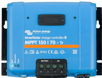
SmartSolar Charge Controller MPPT 150/70-Tr without optional display