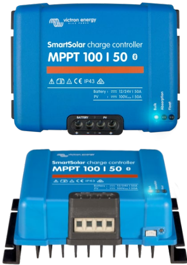
SmartSolar Charge Controller MPPT 100/50