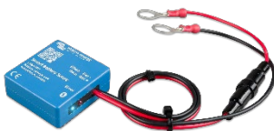
Bluetooth sensing Smart Battery Sense