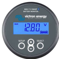
Bluetooth sensing BMV-712 Smart Battery Monitor