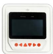
BlueSolar Pro Remote Panel