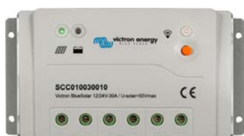
BlueSolar PWM-Pro 10A