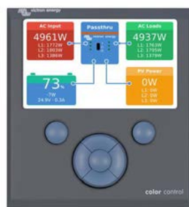
Color Control panel, showing a PV application