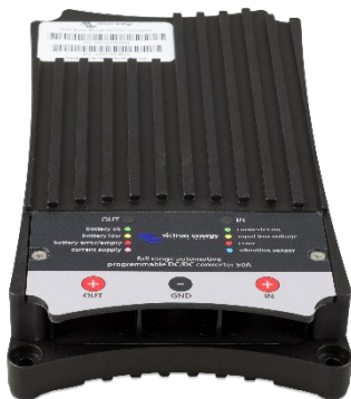
OUT LED indicator IN LED indicator