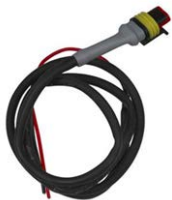
Control cable for Cyrix-ct 12/24-230 Length: 1 m