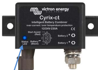
LED status indicator