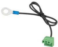
Connector with preassembled DC minus cable (included)