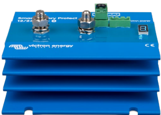
Smart BatteryProtect BP-220