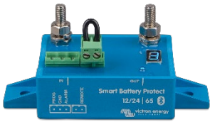
Smart BatteryProtect BP-65