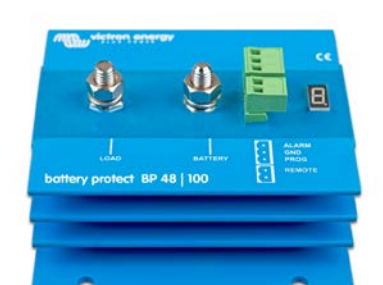
BatteryProtect BP 48-100