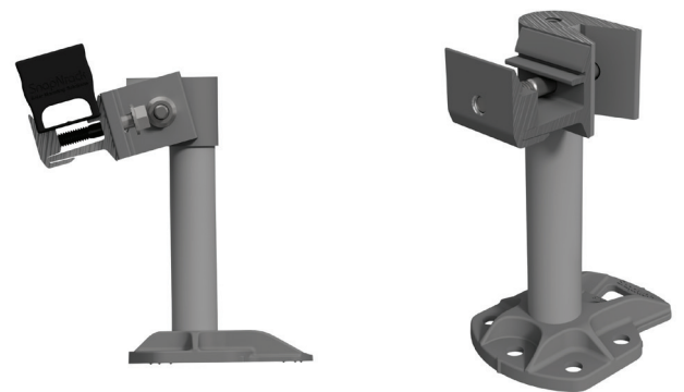
Tilt Mount Assembly