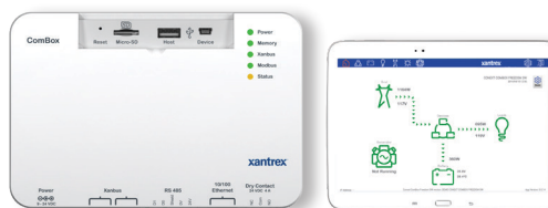
FREEDOM SW Conext Combox (809-0918)

Available telephone to network cable adapter to avoid the need to replace cables when replacing and old inverter. (#808-9010 sold separately)