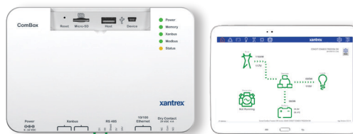
FREEDOM SW Conext Combox (809-0918)

Available telephone to network cable adapter to avoid the need to replace cables when replacing and old inverter. (#808-9010 sold separately)