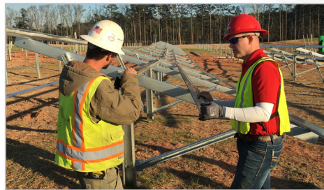
COMMERCIAL PARTNERSHIP EXPERIENCE THAT MAKES A DIFFERENCE