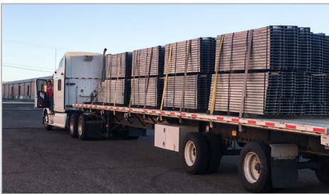
IN STOCK & READY TO SHIP THE BEST SOLUTION IS AVAILABLE