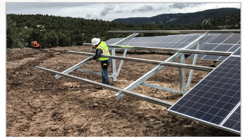
INSTALLATION EXPERIENCE REFINED WITH YOU IN MIND