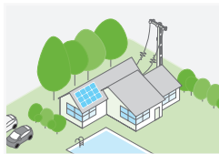
Residential grid-tie solar with backup power