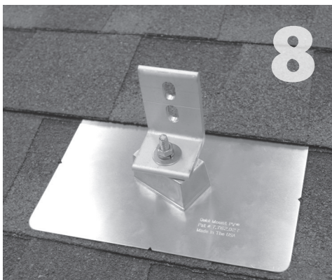
8 Using the rack kit hardware, secure the racking (L-foot) to the mount using torque specs from racking manufacturer. If racking manufacturer does not specify torque setting, tighten to 13 ft.-lbs.

You are now ready for the rack of your choice. Follow all the directions of the rack manufacturer as well as the module manufacturer.