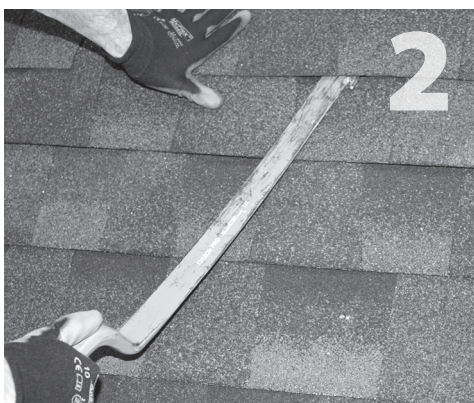
2 Carefully lift composition roof shingle with roofing bar, just above placement of mount. Remove nails as required. See "Proper Flashing Placement" on next page.