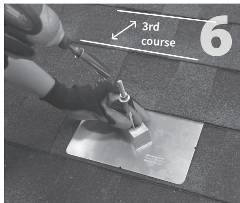
6 Slide flashing into position. Prepare hanger bolt with hex nut and sealing washer. Insert into hole and drive hanger bolt until QBlock stops rotating easily. Do NOT over torque.