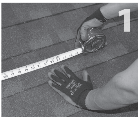
1 Locate, choose, and mark centers of rafters to be mounted. Select the courses of shingles where mounts will be placed.

WARNING: Quick Mount PV products are NOT designed for and should NOT be used to anchor fall protection equipment.