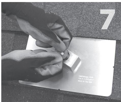
7 Insert EPDM rubber washer over hanger bolt into block.