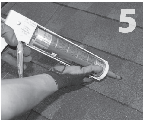
5 Clean off any sawdust, and fill hole with sealant compatible with roofing materials.