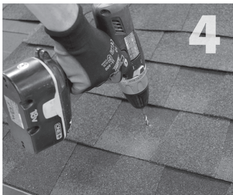
4 Using drill with 7/32" bit, drill pilot hole into roof and rafter, taking care to drill square to the roof. Do not use mount as a drill guide. Drill should be 'long style bit', aka 'aircraft extension bit' to drill a 3" deep hole into rafter.