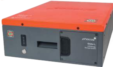
Rack Mount Configuration

Now With Third-Party Inverter Compatibility