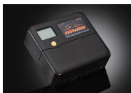
Dingo 20/20 Negative ground System voltage settings 12/24/32/36/48V Max. charge/load current: 20A