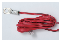
DTB Remote temperature sensor for Dingo series charge controllers Bolt-on