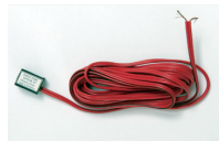
DT Remote temperature sensor for Dingo series controllers Neoprene