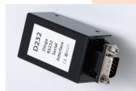
D232 RS232 Interface for Dingo Series Remote access via modem Access system data/settings