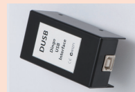
DUSB USB Interface for Dingo Series Access system data/settings