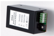
DSA External Shunt Adapter allows the Dingo to measure charge or load currents which do not go through the controller internal SHUNT