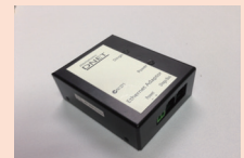
DNet Ethernet adapter for Dingo series Remote access to real time system data Auto-log data via DNet Capture PC app