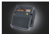
Dingo 40/40P Positive Ground System voltage settings 12/24/32/36/48V Max. charge/load current: 40A