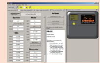
PRISM PC software for Dingo series Make settings changes and access data in real time Access up to 512 days worth of data