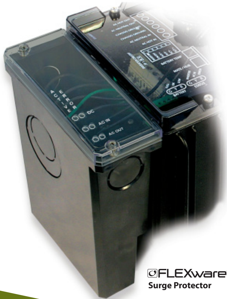
FLEXware™ Surge Protector

OutBack Power’s FLEXware Surge Protector is a seamlessly integrated balance-of-system component for the FX Series Inverter/Charger. The FLEXware Surge Protector was designed by OutBack Power engineers specifically for OutBack FX Series Inverter/Chargers, and provides multiple levels of protection for the vital electrical components of the Inverter/Charger in the event of an electrical surge. The sophisticated design allows for both AC and DC protection on multiple circuits (two AC and one DC) via thermally fused Metal Oxide Varistors (MOVs). LED visual indicators provide at-a-glance status monitoring allowing system users to determine FLEXware Surge Protector operational status in real-time. The FLEXware Surge Protector is designed to operate between 120 to 240 VAC at 50/60 Hz and 12 to 48 VDC. Its multiple mounting configurations allow it to be incorporated into any OutBack Power system.