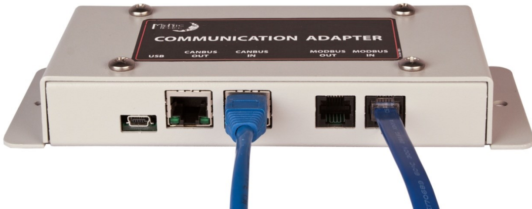
Typical Wall Mounted Connections