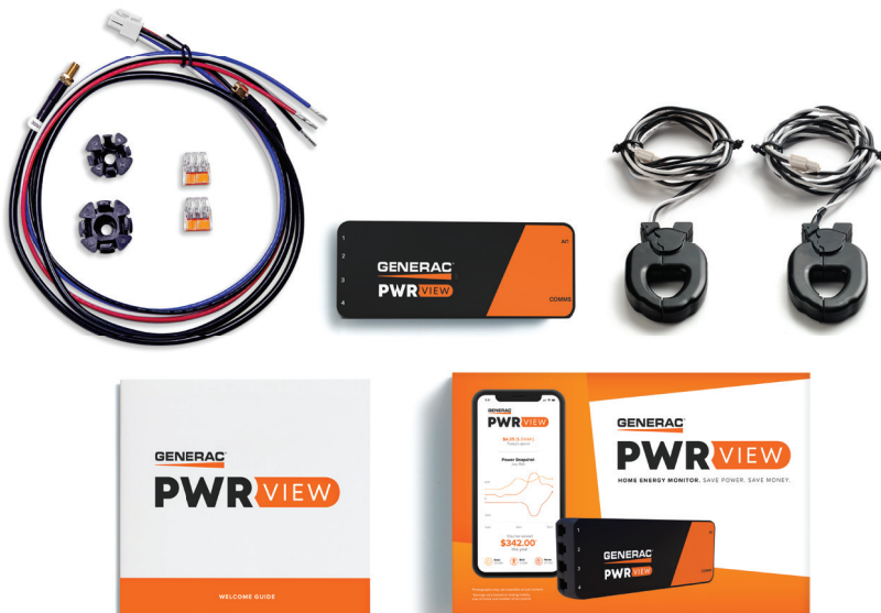
HOME ENERGY MONITORING KIT W2HEM