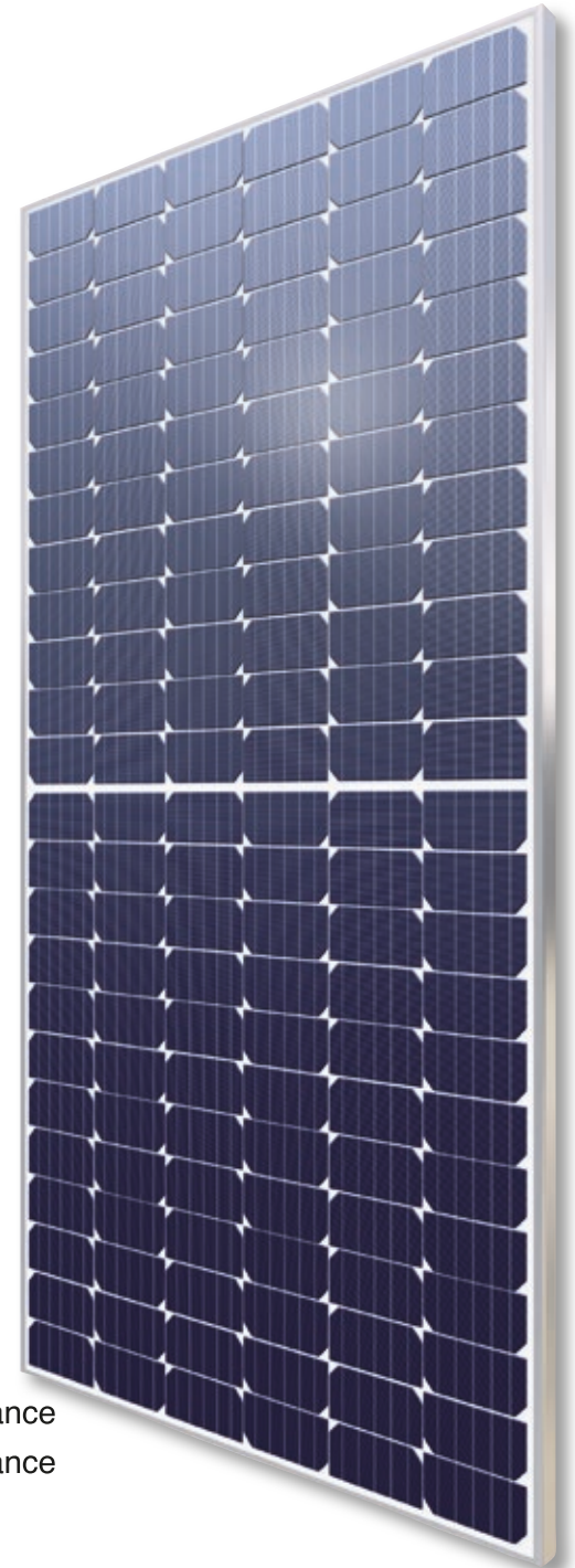
Fig. similar 144MHUSA210203A

High quality junction box and connector systems