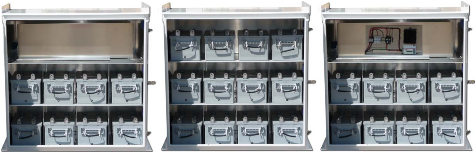
(8) Battery Bank : 8G8D