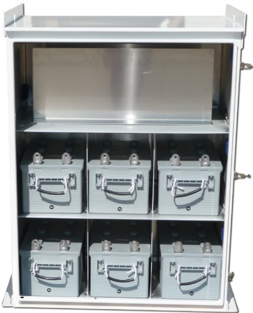
(6) Battery Bank : 8G8D