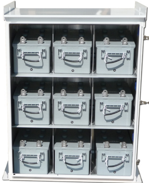
(9) Battery Bank : 8G8D