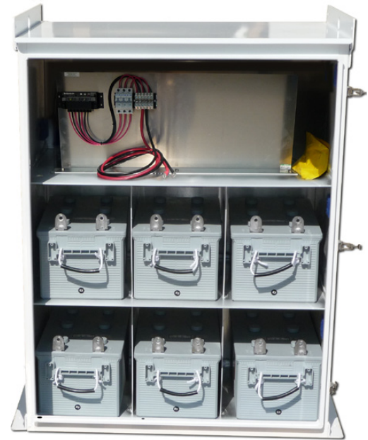
Back Panel Assembly