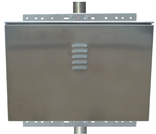
Mounts to 2-3" schedule 40 pole using 2 u-bolts (Bolts not included)