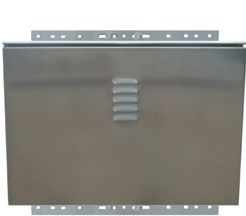
Mounts on wall using 4 lag bolts (Bolts not included)