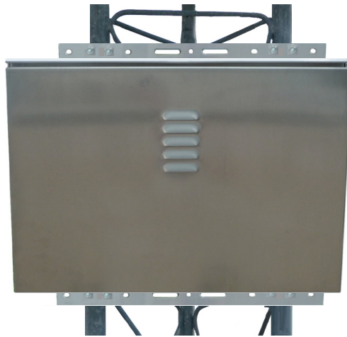
Mounts to ROHN25 tower using 4 u-bolts (Bolts not included)