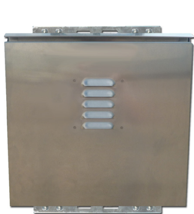
Mounts on wall using 4 lag bolts (Bolts not included)