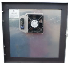
Door fans available in 12V, 24V, and 48V DC/120V AC