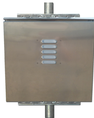
Mounts to 2-3" schedule 40 pole using 2 u-bolts (Bolts not included)