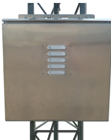
Mounts to Rohn25 tower using 4 u-bolts (Bolts not included)