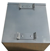
Banding available for unique mounting structures